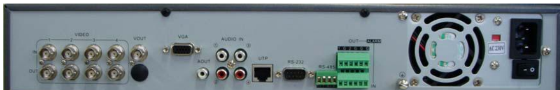
DS-7004HI Rear Panel