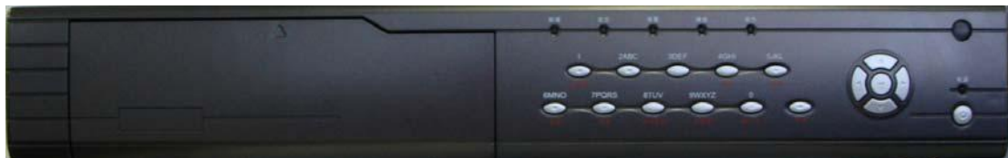
DS-7000HI Front Panel

DS-7000HI series device has advantages of digital video recorder (DVR) and digital video server (DVS). It can work standalone, also be used to build up a powerful surveillance network. DS-7000HI series device can be widely used in bank, telecommunication, transportation, factories, warehouse, irrigation, etc.