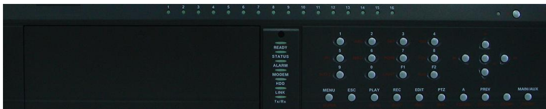
DS-8000HFI-S Front Panel

DS-8000HFI-S series combines the advantages of Digital Video Recorder (DVR) and Digital Video Server (DVS). It is widely applied as a stand-alone unit or a part of a powerful surveillance system.