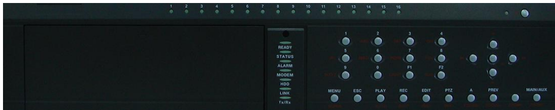
DS-8000HSI-S Front Panel

DS-8000HSI-S series combines the advantages of Digital Video Recorder (DVR) and Digital Video Server (DVS). It is widely applied as a stand-alone unit or a part of a powerful surveillance system.