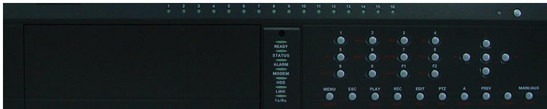
DS-8000HTI-S Front Panel

DS-8000HTI-S series combines the advantages of Digital Video Recorder (DVR) and Digital Video Server (DVS). It is widely applied as a stand-alone unit or a part of a powerful surveillance system.